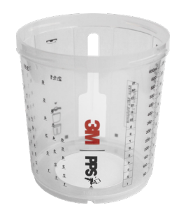
3M<sup>™</sup> PPS<sup>™</sup> 2.0 Cups