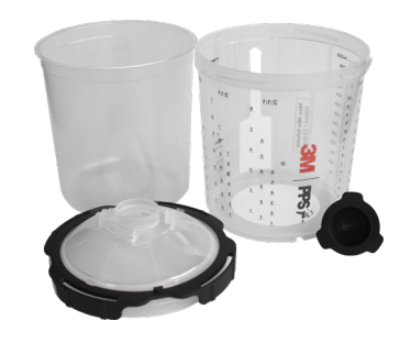
3M™ PPS™ 2.0 Lids and Liners