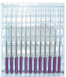
91-215 AAA Tip Cleaning Needles