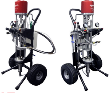
CATALYZER™ Cart Mount