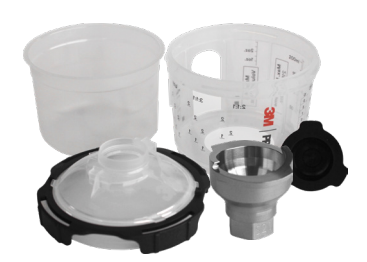
3M™ PPS™ Cup Components